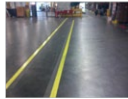
CSI Division 9: Finishes - Flooring